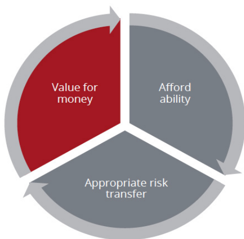
Figure 1. When to do PPPs?

India, Kenya and South Africa represent different contexts in which PPPs have evolved. However, in all these countries PPPs are seen as a supplementary source of private financing for creating public assets to achieve broader development goals. India, Kenya and South Africa have all concluded that government resources are inadequate to meet demands for investments. The PPP practitioners from these countries stressed the importance of remembering that PPPs create public assets with private money. It is thus not a question of privatisation (when governments transfer public assets to private actors). The starting point should therefore always be the priority needs of the country. Once these needs have been determined, PPPs can be identified as a financing source for those projects with commercial potential. Beside the value proposition and the affordability of a PPP, the potential PPP project should also demonstrate an appropriate risk transfer to the private sector partner as captured in figure 1.